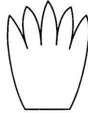
Claws for feet (Cut 4)